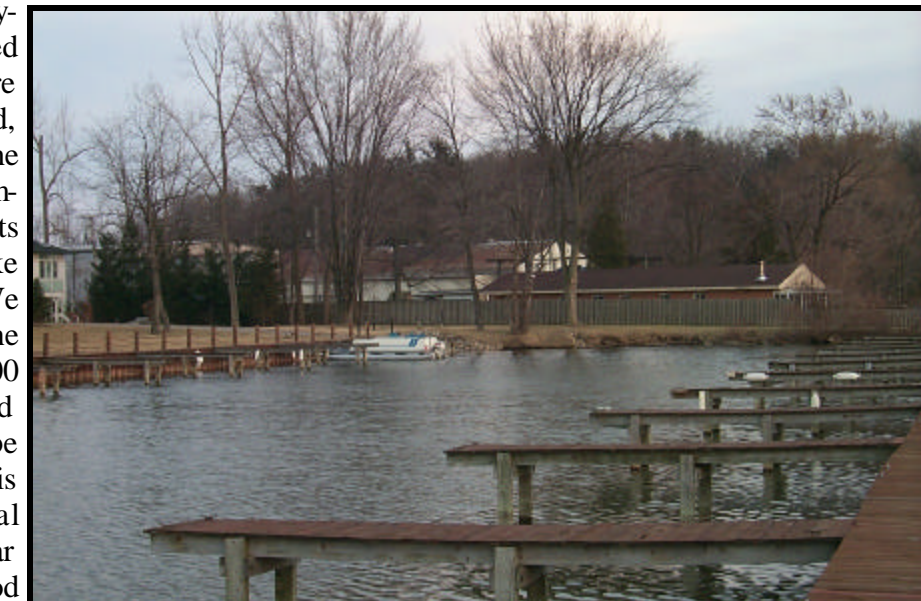
One Forest Bay resident anxiously awaits boating season. Picture was taken on April 3, 2001.